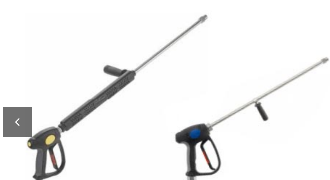
Guns with Lances