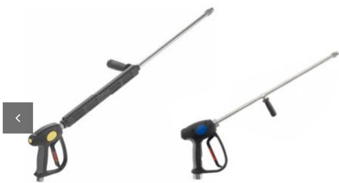
Guns with Lances