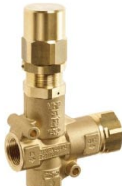
Non Return Valves