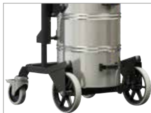
OPTIM TROLLEY IS EXTREMELY DURABLE AND MANEUVERABLE