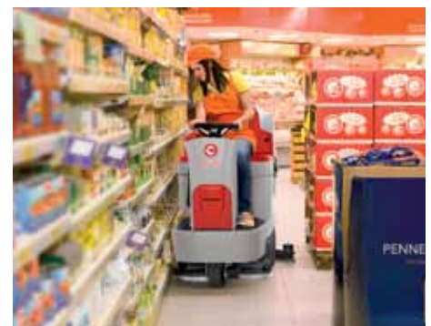
Easy rubber replacement without any tools on the exclusive Comac squeegee (Patent Pending)