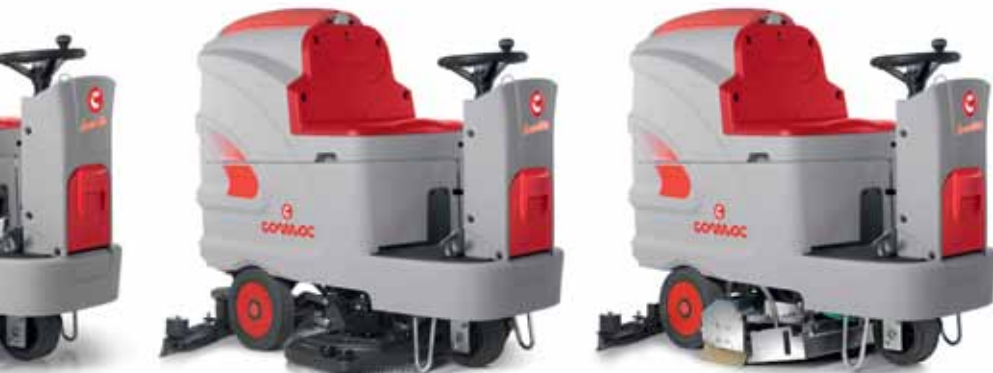
Innova 100 B

A simple device (optional) allows the quick filling of the tank with clean water without the presence of the operator