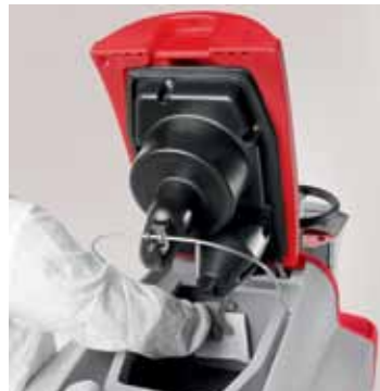
Easy and complete tank sanitizing

Easy battery charging thanks to the possibility of an onboard battery charger (on request)