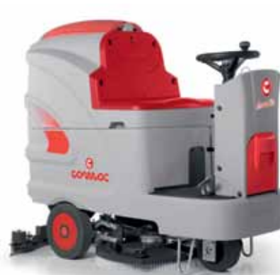
Innova 60 B